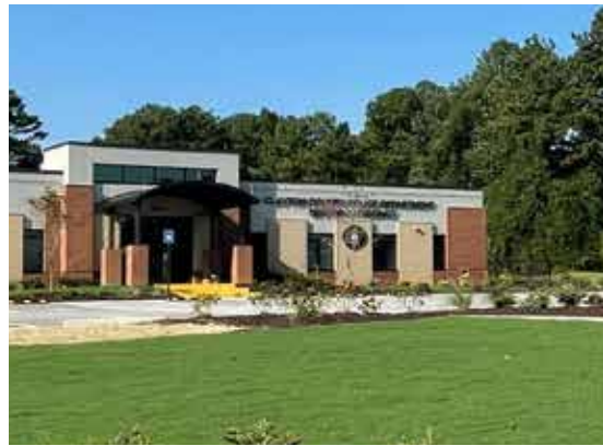
Sector 2 - Police Precinct