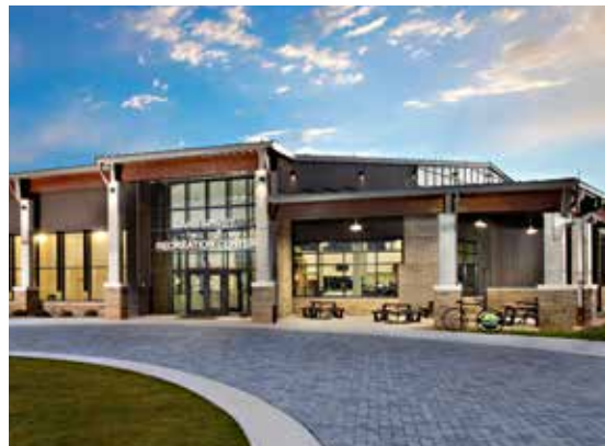
Lake Spivey Recreation Center