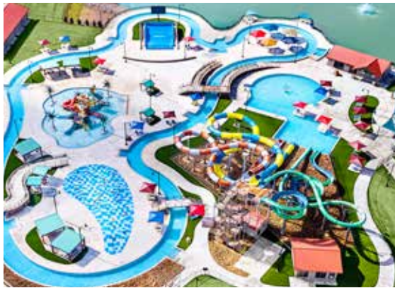
Spivey Splash Water Park