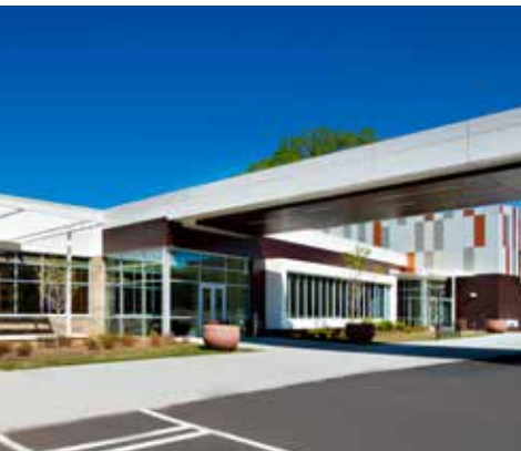
Flint River Community Center