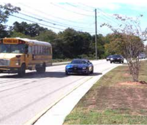
Panola Road Widening