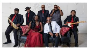
SEPTEMBER 14 - Deep Velvet