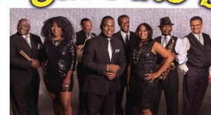
AUGUST 31 - Crystal Clear Band