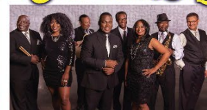
AUGUST 31 - Crystal Clear Band