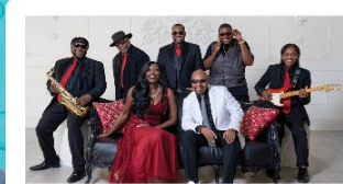
SEPTEMBER 14 - Deep Velvet